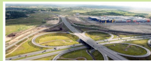
Outer Ring Road